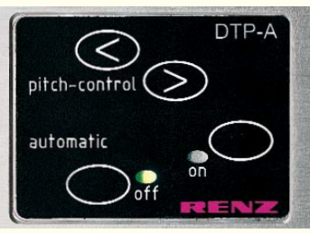
simple control panel for format adjustment and operation mode

Gestaltung Kunz Produkt und Grafik, Schwäbisch Gmünd, Telefon 07175 99 91 20